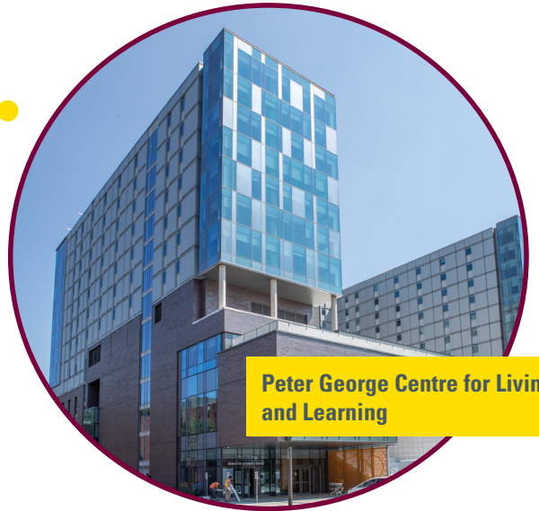
Peter George Centre for Living and Learning