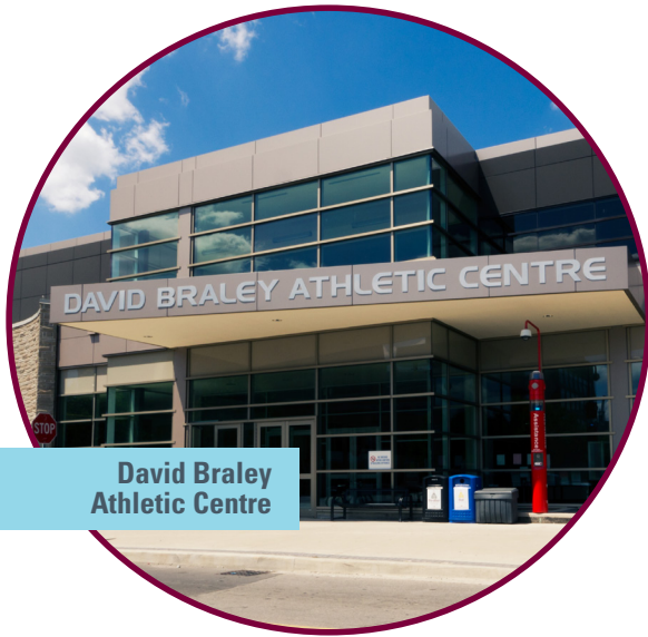
David Braley Athletic Centre