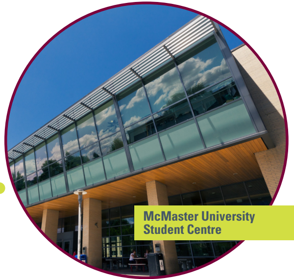
McMaster University Student Centre